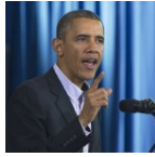
Obama nominates new Global AIDS office director