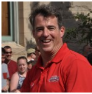
Maryland to recognize Utah same-sex marriages