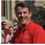
Maryland to recognize Utah same-sex marriages