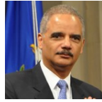
Obama admin to recognize Utah same-sex marriages