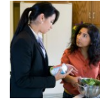
Realistic weight loss resolutions