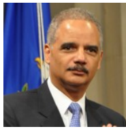
Obama admin to recognize Utah same-sex marriages