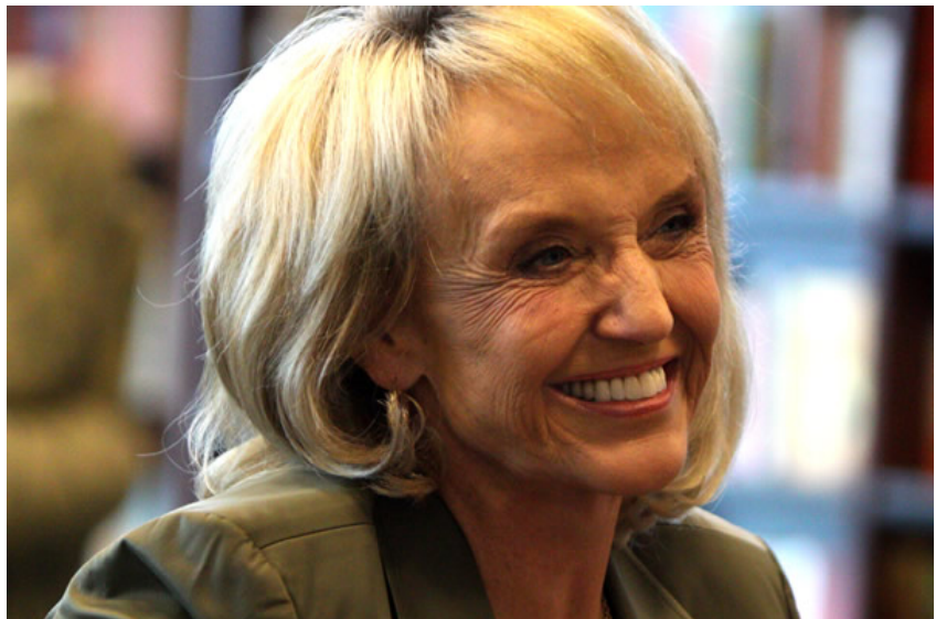
Gov. Jan Brewer (R-Ariz.)

The lawsuit names Gov. Jan Brewer and Attorney General Tom Horne as defendants.