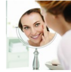
Maintaining glowing skin as the seasons shift