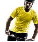
New Year, New You