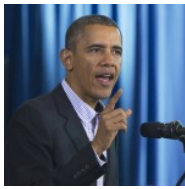
Obama nominates new Global AIDS office director