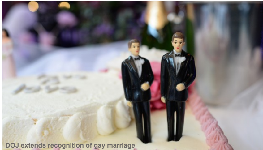
DOJ extends recognition of gay marriage