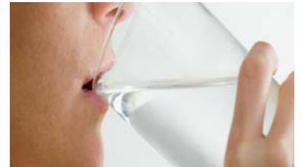
UofA prof proposes water market to fight drought