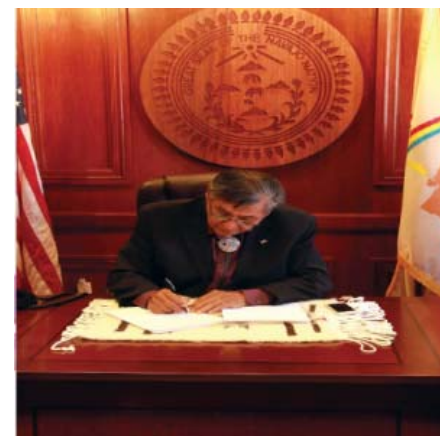
President Shelly makes a stand for Navajo language, vetoes council resolution