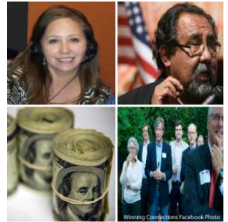
Grijalva makes winning connections with DC money

Blind hatred of the Tea Party and conservatives can cause liberals to overstep their authority in their "progressive campaigns of tyranny." But then they get surprised when their misconceptions and invented stereotypes turn out to not be true. They are also shocked to find Tea Party candidates not giving up and fighting back.