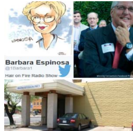
Maricopa County Republican precinct committee members must defend bylaw violations