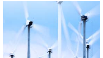
British study shows wind power generates only 2 percent of rated capacity