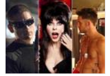
HOT SHEET Hot Sheet: Divas and Demons