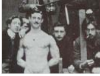
ART In The Studio: Artists and Nude Models