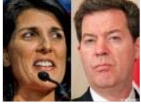
MARRIAGE EQUALITY Are These the Most Antigay Governors in America?