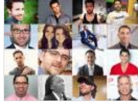
31 DAYS OF PREP 35 Activists, Doctors, and Orgs Speak Out for PrEP