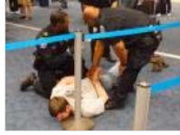
CRIME WATCH: Texas Airline Crowd Tackles Antigay Attacker