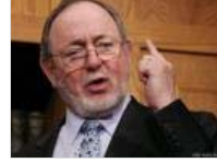
POLITICIANS Alaska Student: GOP Rep's Apology 'Doesn't Mean Crap'