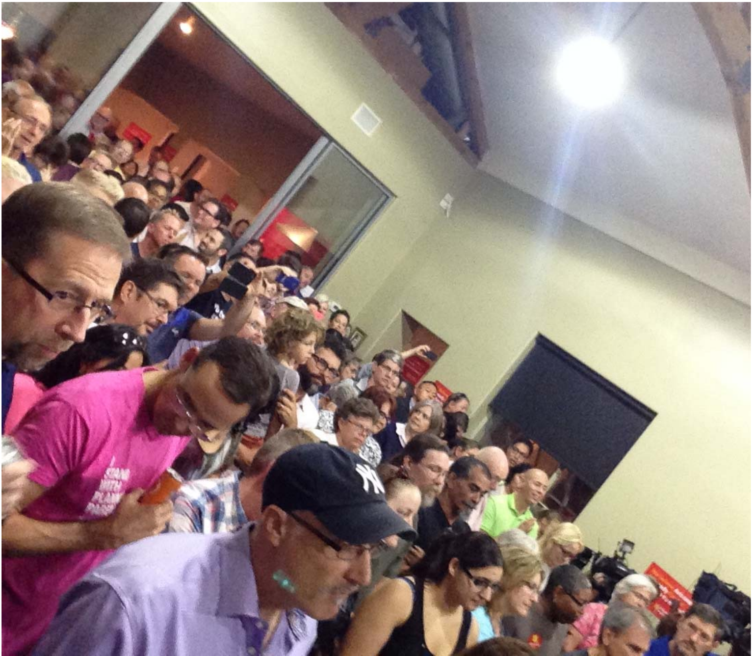
Dozens of same-sex marriage supporters gathered at the Southwest Conference United Church of Christ in Phoenix.