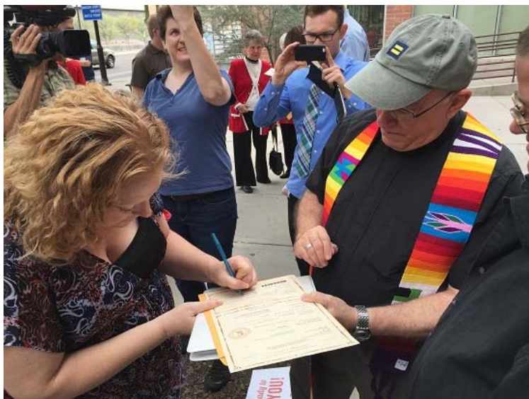
Kuhn and Lacount have six children, including one adopted child and five biological kids that Lacount had in a previous heterosexual relationship before she began dating Kuhn 10